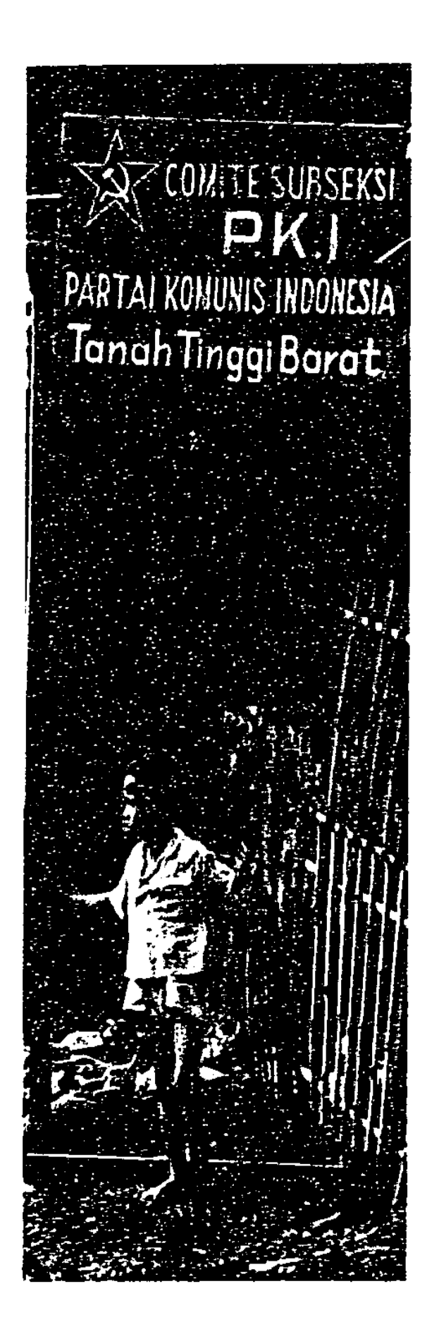
HEADQUARTERS—In the Jakarta slums, the entrance to a Communist party district office.

Evidence on this internal struggle is extremely sketchy, however, and whatever adjust-