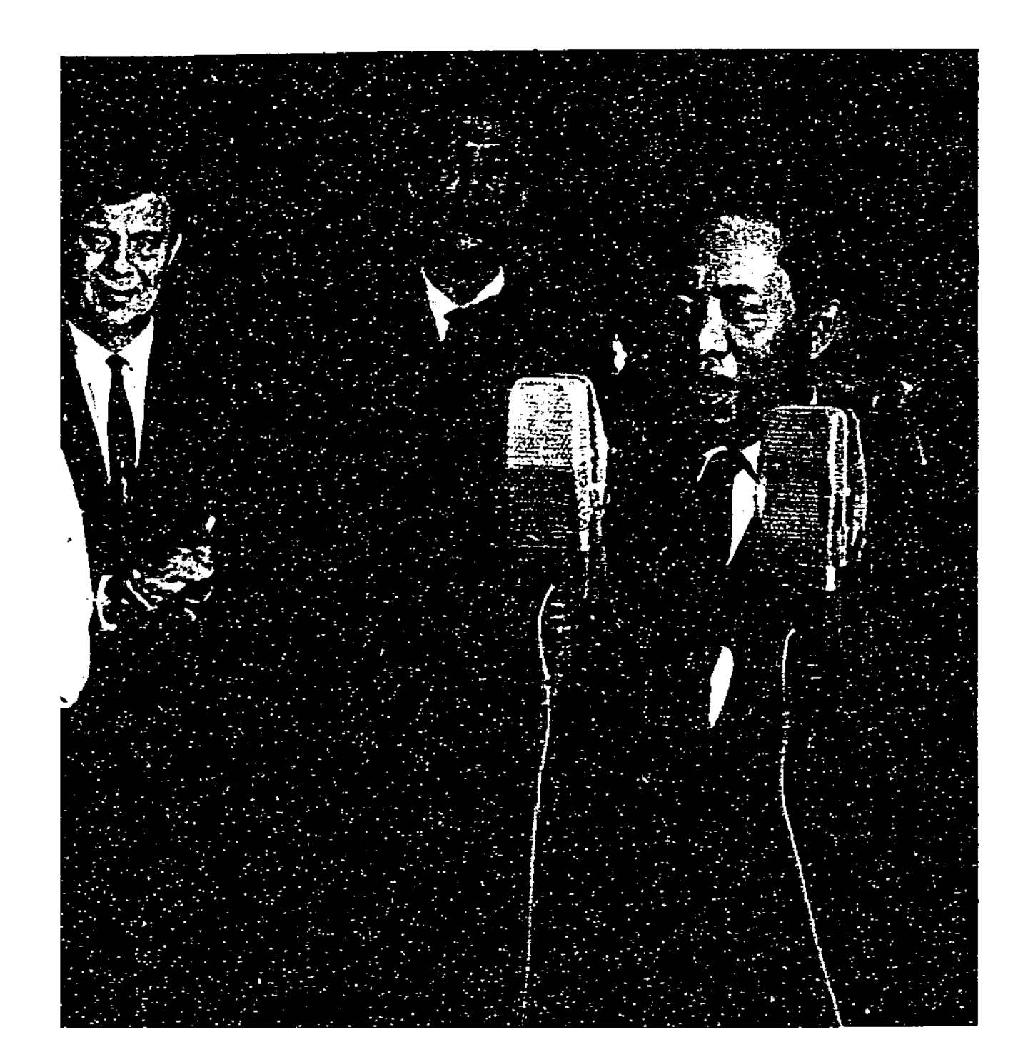
Bogor, Sukarno, left, and Communist chief Aidit, at the microphones, take turns singing for a group of Russian visitors.

Peking and at maintaining Indonesia in a perpetual state of turbulence conducive to Communist growth. "It is the responsibility of each member of the party," Aidit told his followers in early 1953, "not only to be a good Communist but also a good nationalist."