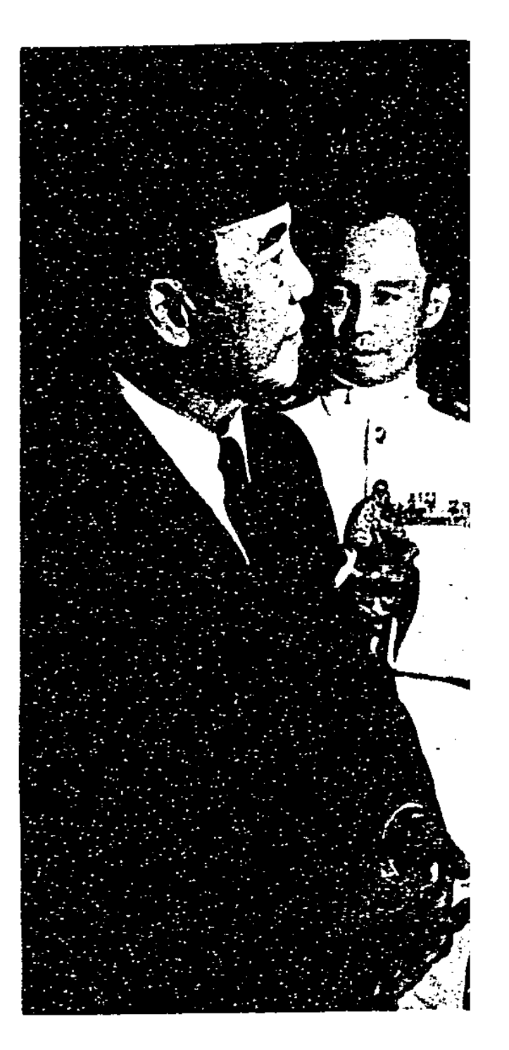
TWOSOME-At a party at the President's weekend palace at

In comparison with the other faction-ridden and corrupt political parties, the P.K.I. is a model of unity, discipline and strength. It is the only party in Indonesia with a national program which is competently executed. Its cadres are well-trained, hard-working and politically and psychologically motivated. They have also displayed a virtue most unusual